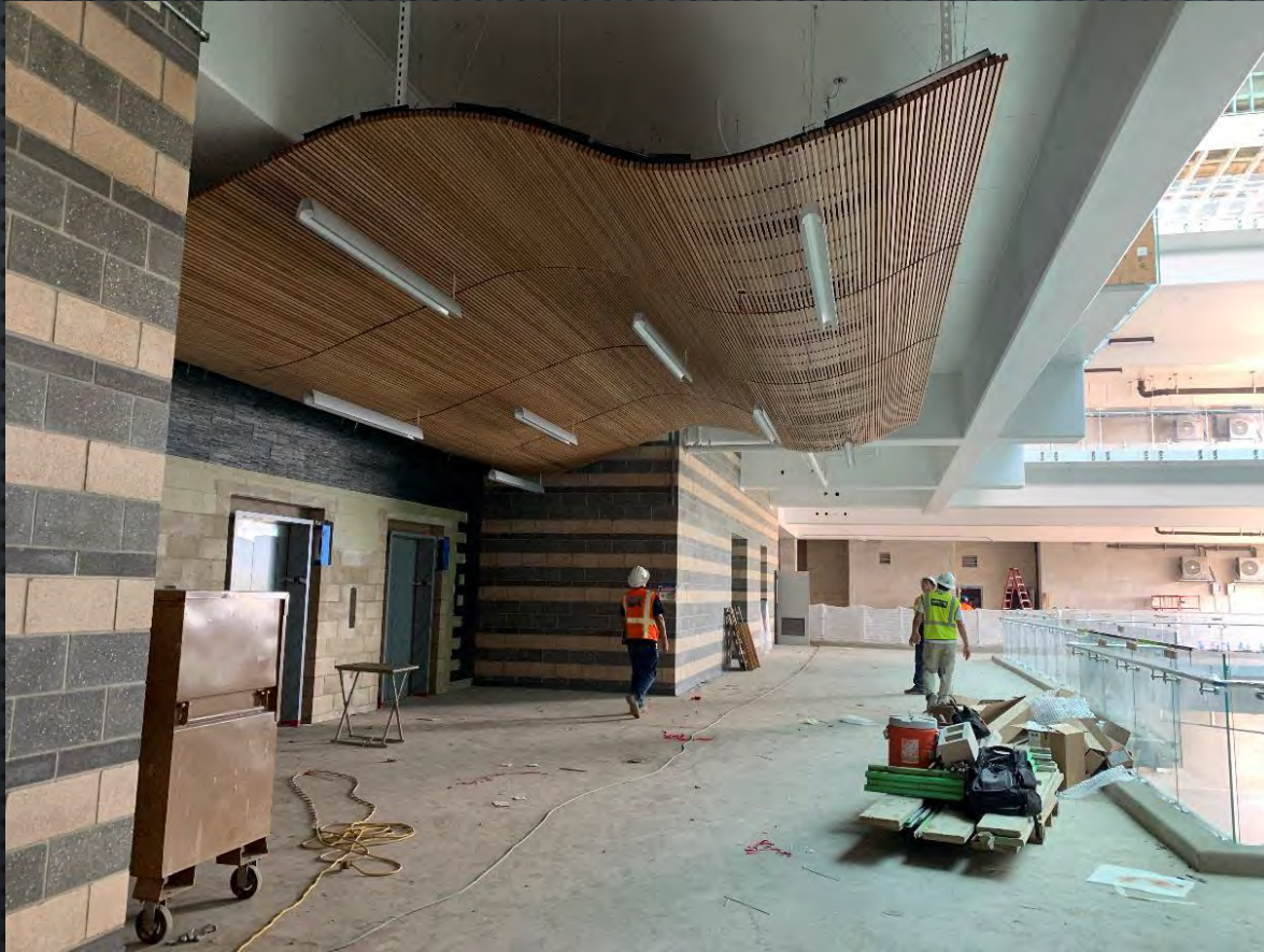
Wooden Ceiling in Elevator Area