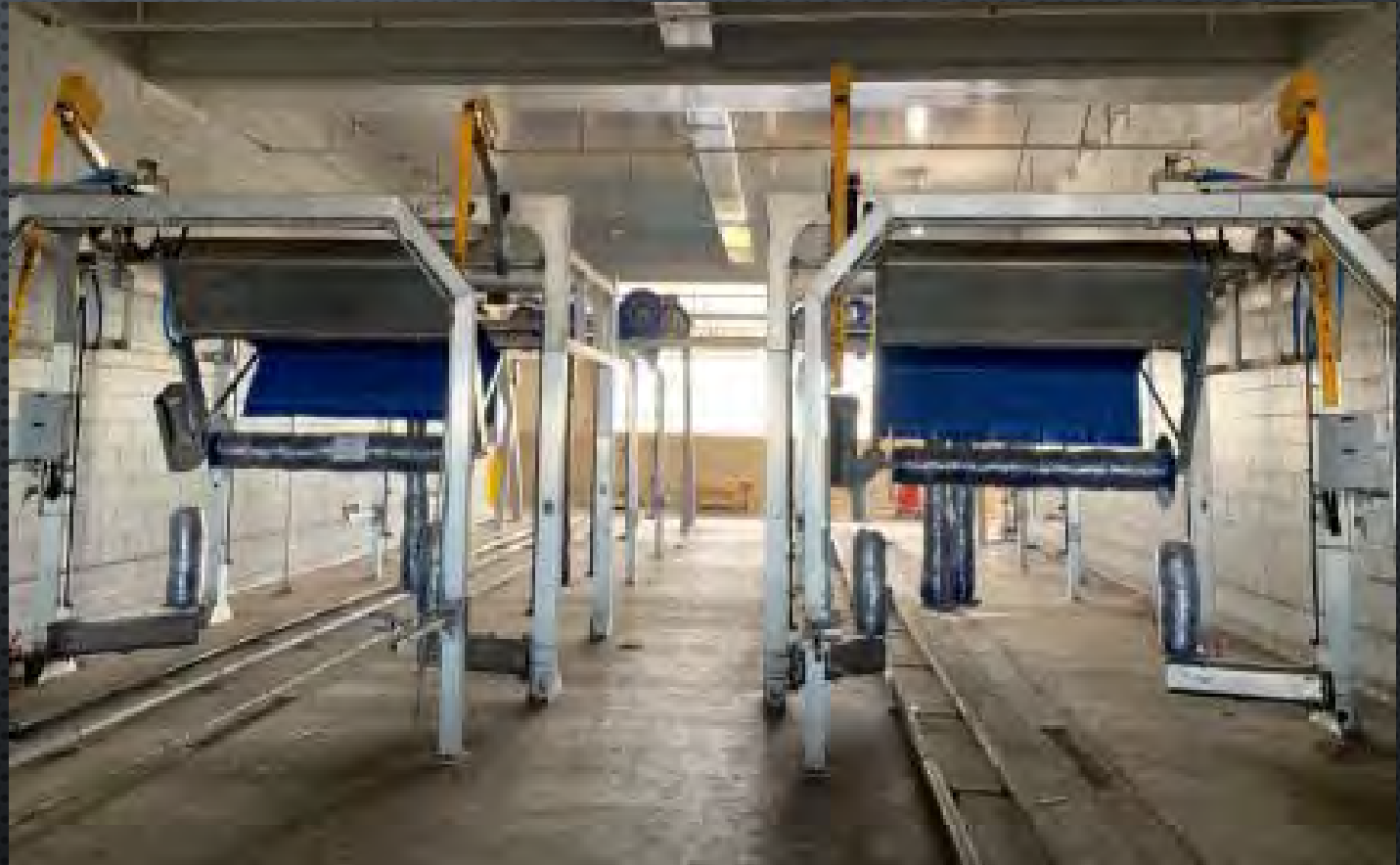
Car Wash Bays