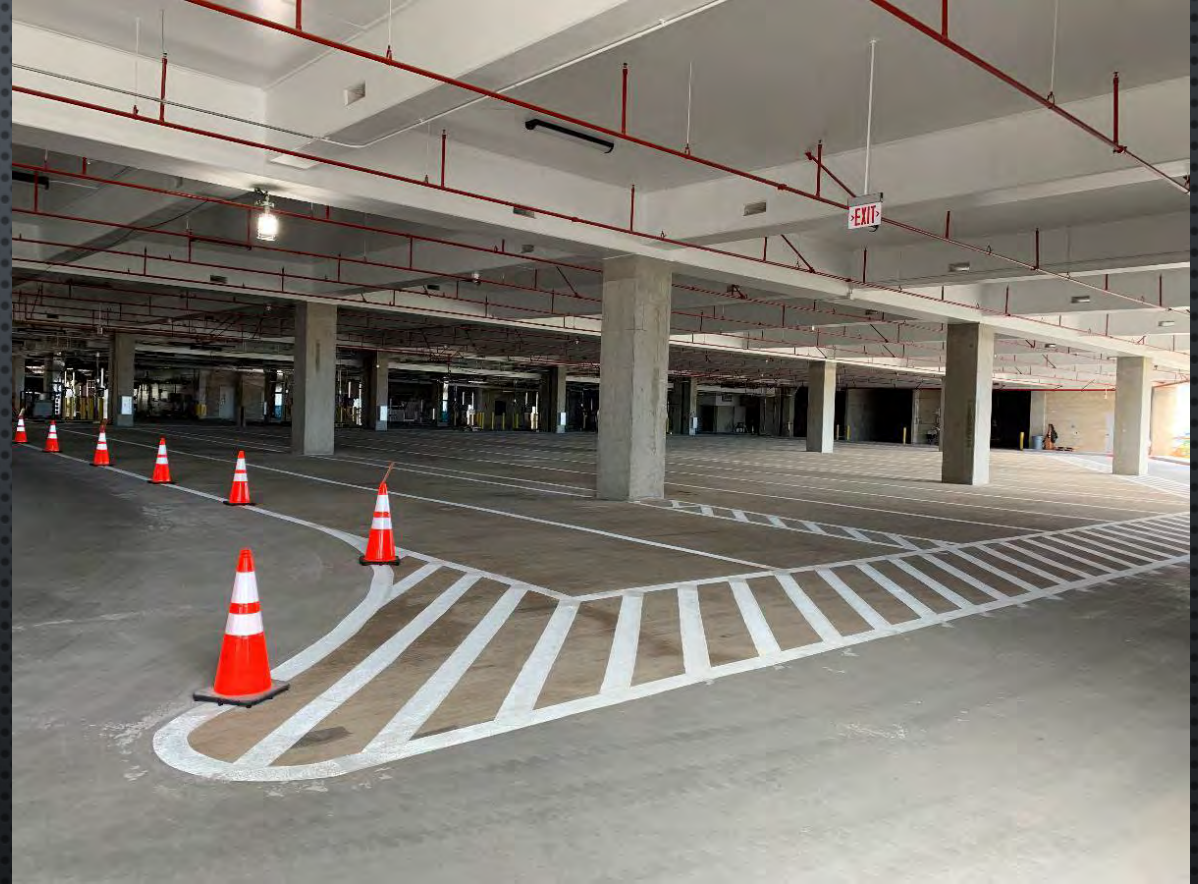
Post Return Staging Area