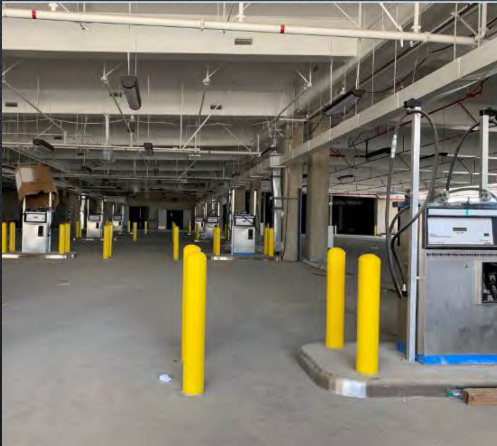
Fueling Bay Area